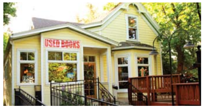
6 | 130 North 100 East