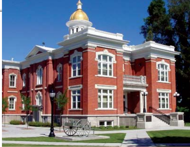
Cache Valley Visitors Bureau 199 North Main Street, Logan

This two-story rock structure built in the 1860s is often referred to as modified or broken saltbox. It is a fine example of the vernacular architecture of the early days of settlement in Cache Valley. The austerity of the structure expresses the struggles of the early pioneers who had to fight for survival. Simplicity, plainness, and utilitarianism are the qualities that make the building significant. The rock is Swan Peak quartzite, which is found locally. The rock was arranged in the wall with three different sides facing out, giving the house a variety of color and texture. The front façade has two doors for two separate entrances important during the long-past days of polygamy, and lending itself nicely as a rental duplex today.