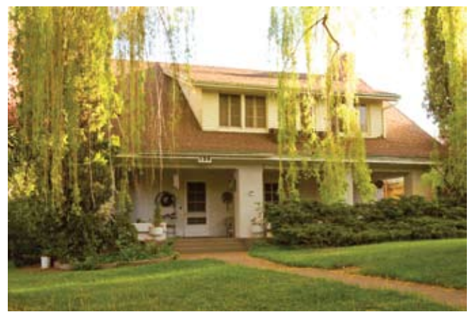
5 | Ezra Taft Benson 139 East 100 North

Brigham Young, president of the LDS Church, sent Ezra Taft Benson to Cache Valley in 1860 to help plan the city and organize wards and stakes (congregations) for the church. Benson chose a plot of land now situated east of the Tabernacle. The foundation of the house is stone quarried at the time of the building of the Temple. Plans for the house followed the plans for the Benson home they left in the East when they followed the Saints to Utah. Mr. Benson worked hard on the design of the city and planned that each home would have enough land for a garden.